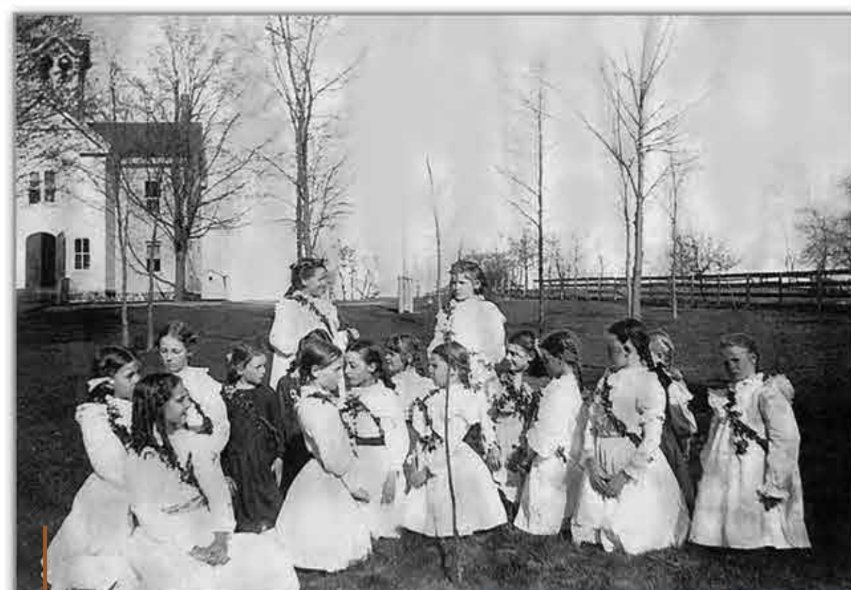
Students on Arbor Day, outside the Union School, an earlier wooden school building at this site, about 1900.