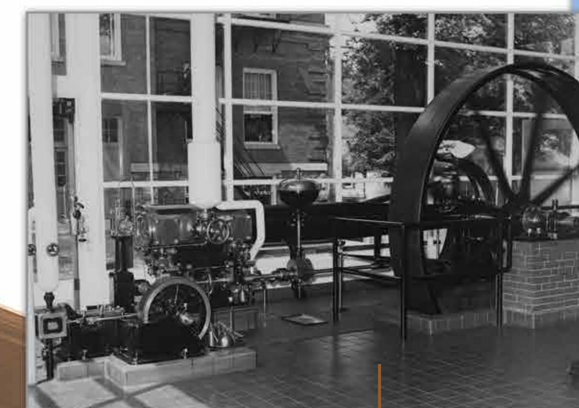
Machinery inside the power plant, with view to back of main building, early 1940s.

At his factories, Henry Ford always enclosed the power generators with windows so they could be easily seen.