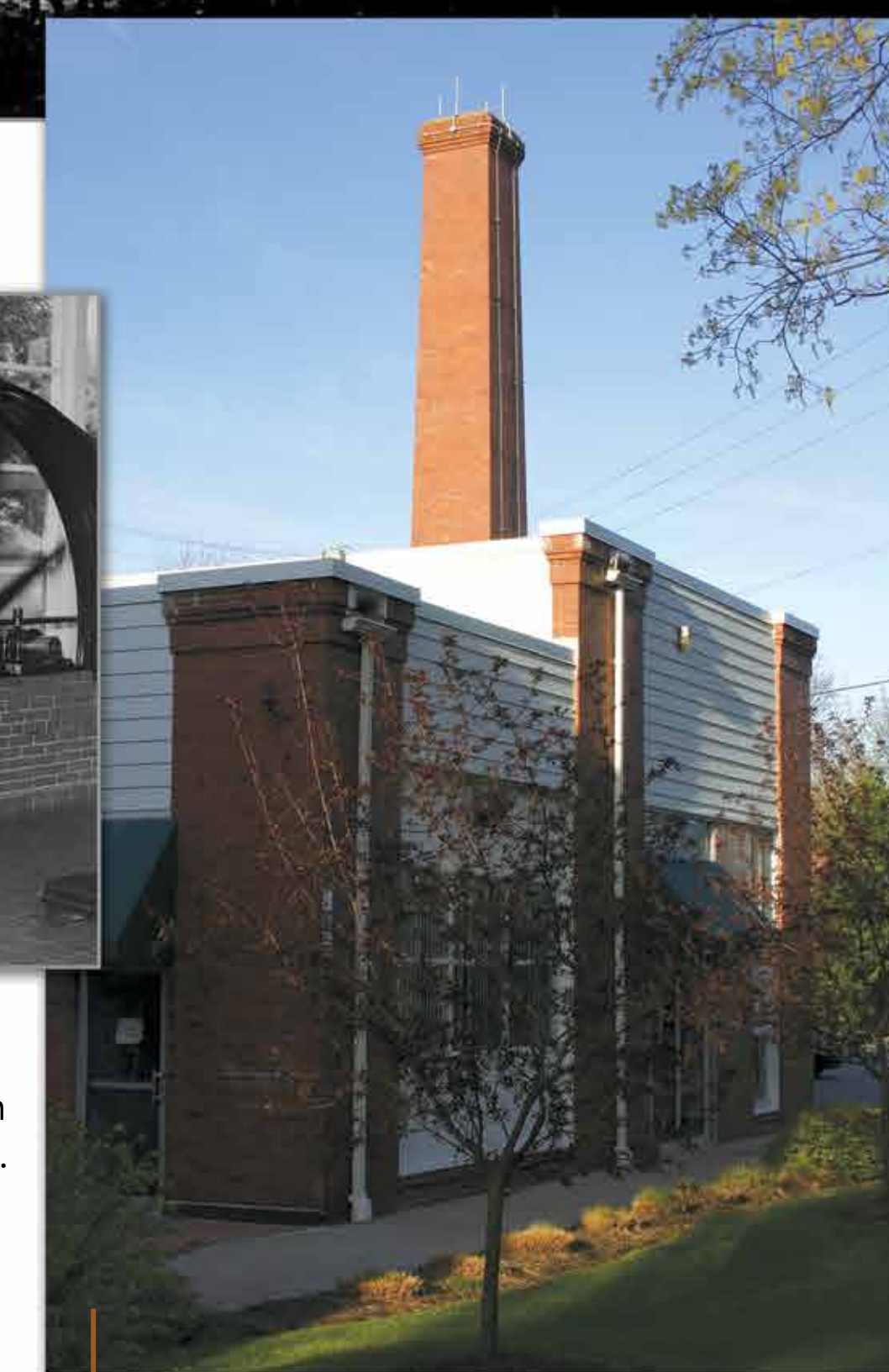
The power plant building, originally built by Ford. The chimney is now home to a large flock of chimney swifts.