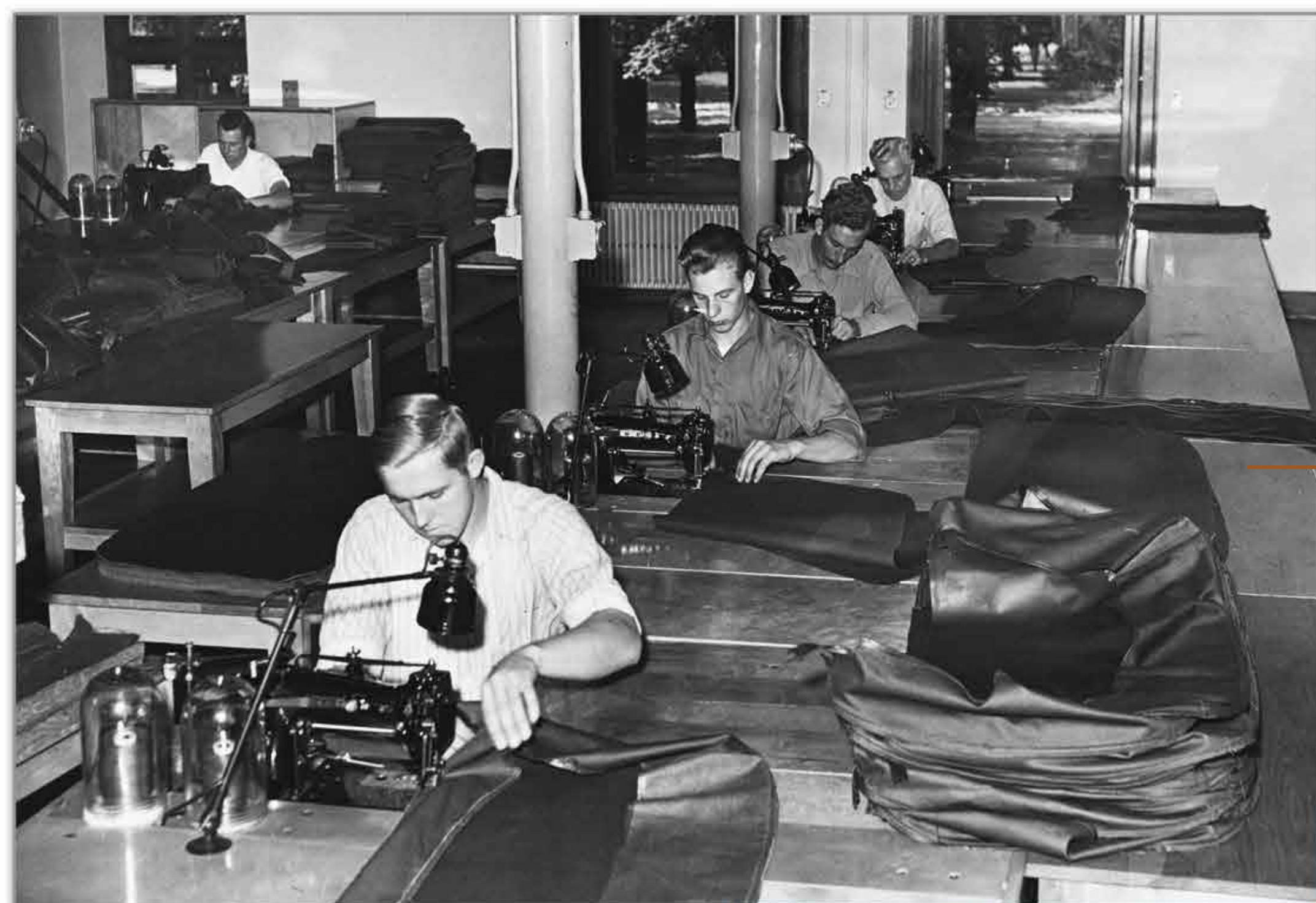
Workers assemble vehicle seat cushions within the former school building, early 1940s.

It was built as Clarkston High School in 1910 and students learned and played here until 1930. In recent years, it was a community center and the Independence Township Hall. But in 1940 the property was bought by Henry Ford to manufacture parts for military and other vehicles during World War II. Ford added a power plant with a smokestack at the back, creating steam power with water from Parke Lake behind the building. Local workers here made vehicle straps and seat cushions.