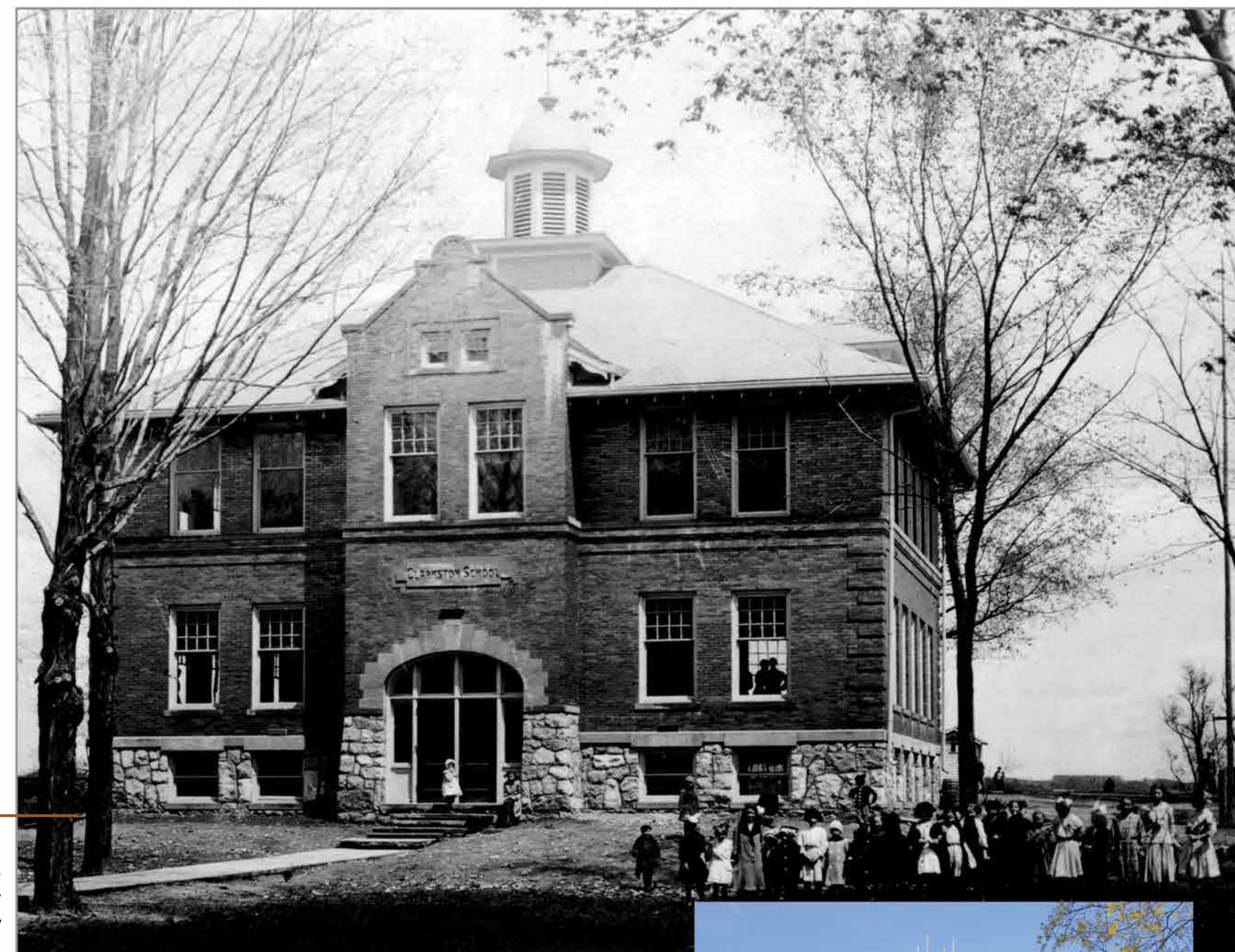
The Clarkston High School building, around 1912.